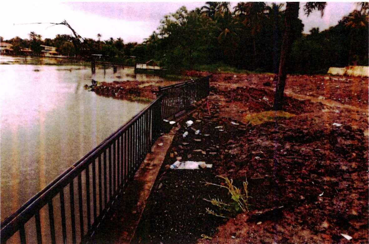
Photograph taken on 12.9.2020 showing the canal bank.